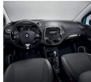
Dark interior colour scheme (optional)