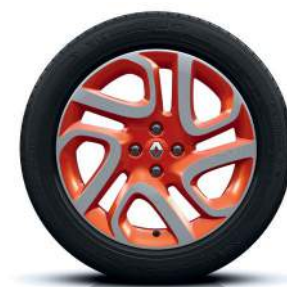
17" orange diamond-cut alloy wheel rims