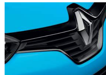
Black radiator grille strip