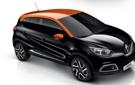
DIAMOND BLACK (MP) ARIZONA ORANGE ROOF (MP)