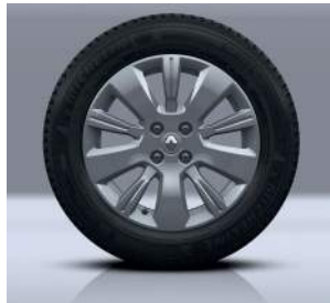
16" alloy wheel rims (standard)