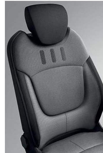
Light grey / Ash grey removable upholstery