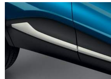
Ivory side protective strip