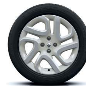
17" ivory diamond-cut alloy wheel rims