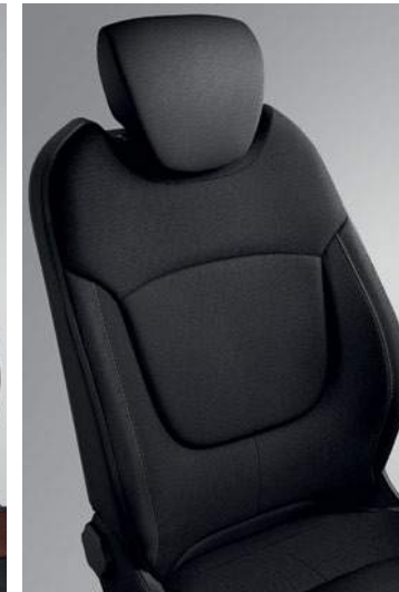
Dark carbon removable upholstery