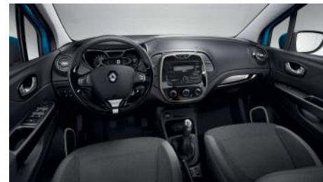
Anodised grey interior trim

2 "ZIP COLLECTION" UPHOLSTERY Removable and machine-washable.