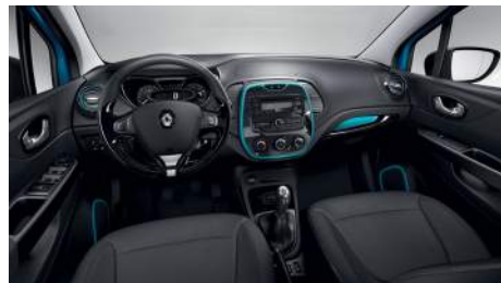
Blue interior trim

Available with light or dark colour scheme.