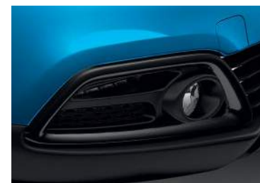
Black fog light surrounds