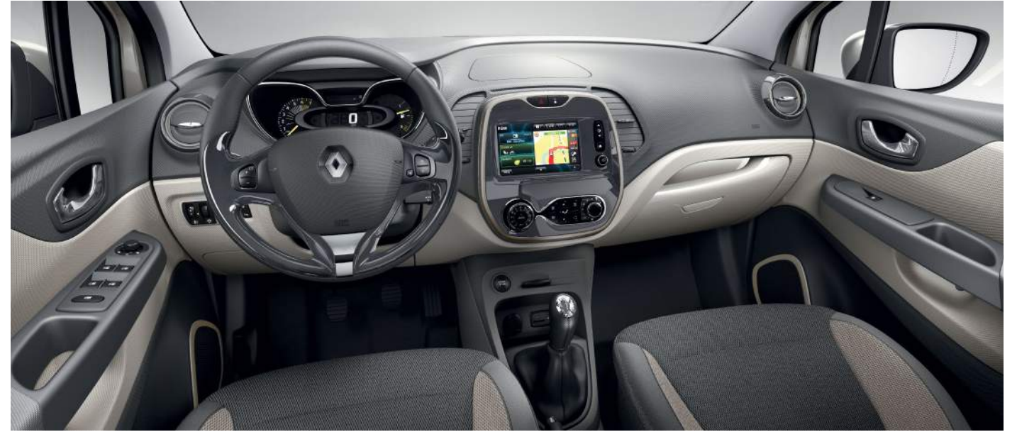
Picture shown with R-Link as an option.