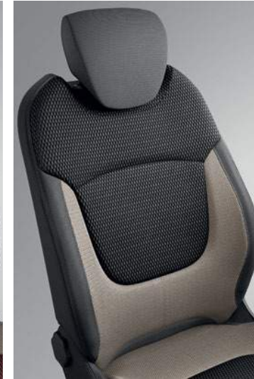
Ivory / Light grey removable upholstery