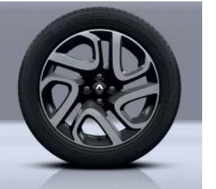
17" black diamond-cut alloy wheel rims