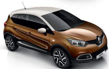
MOCHA BROWN (MP) IVORY ROOF (CO)