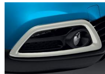
Ivory fog light surrounds