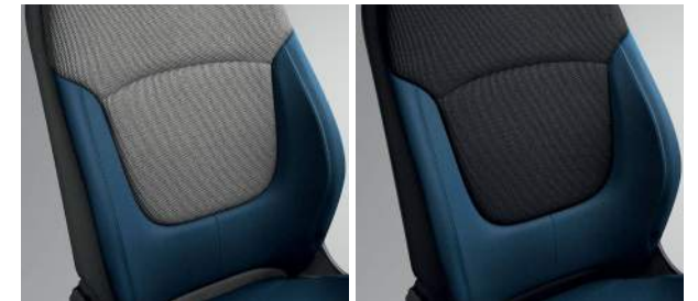
Blue / Ivory upholstery