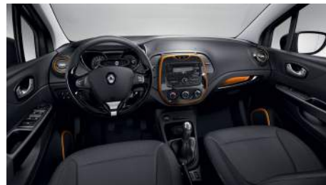
Arizona orange interior trim