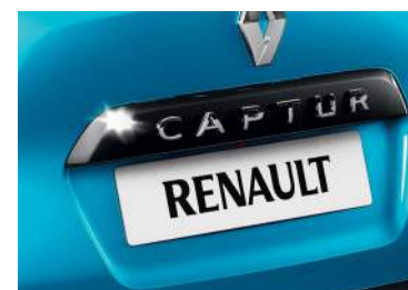
Black tailgate strip