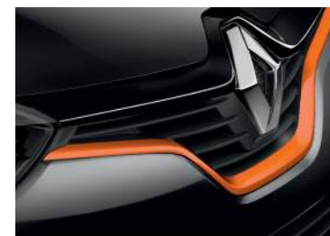
Orange radiator grille strip