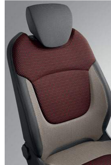
Ivory / Orange removable upholstery