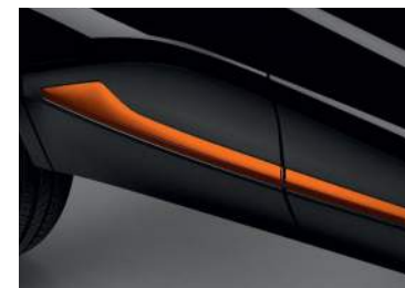
Orange side protective strip