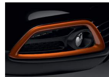
Orange fog light surrounds