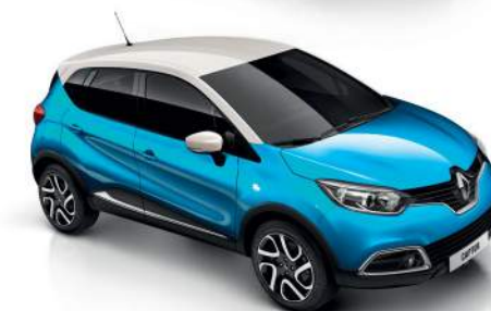
PACIFIC BLUE (MP) IVORY ROOF (CO)