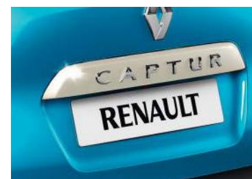
Ivory tailgate strip