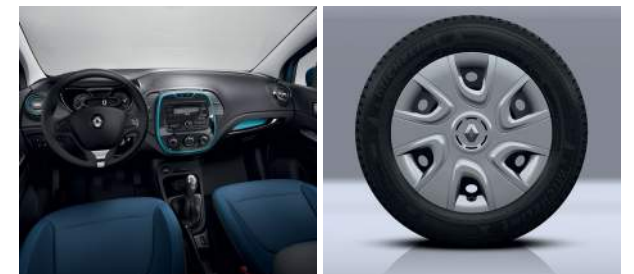
Dark interior colour scheme