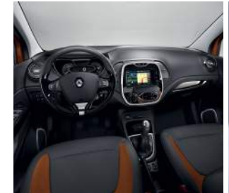
Light interior colour scheme (optional)