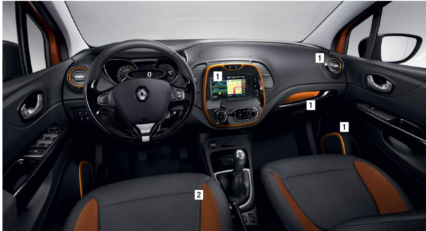
1 Interior trims: Air vent surrounds Centre console surrounds

Interior trims - "Zip Collection" upholstery.