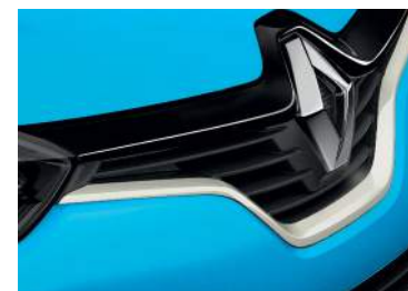
Ivory radiator grille strip