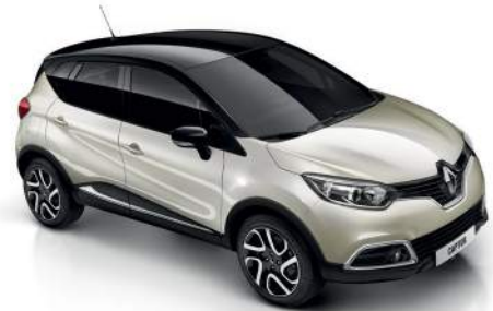
IVORY (CO) DIAMOND BLACK ROOF (MP)

OPAQUE, GLOSSY, NON-METALLIC, REFLECTIVE... THE COLOUR PALETTE REVEALED, TINGED WITH EMOTION.