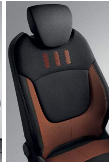
Orange / Dark carbon removable upholstery