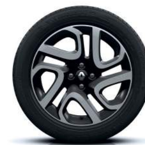
17" black diamond-cut alloy wheel rims