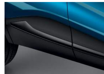
Black side protective strip