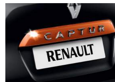
Orange tailgate strip