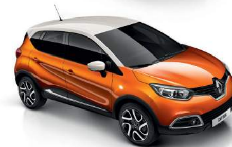
ARIZONA ORANGE (MP) IVORY ROOF (CO)