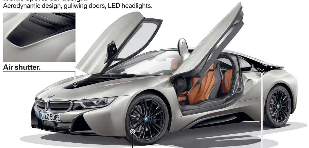
New 20-inch wheels (optional).